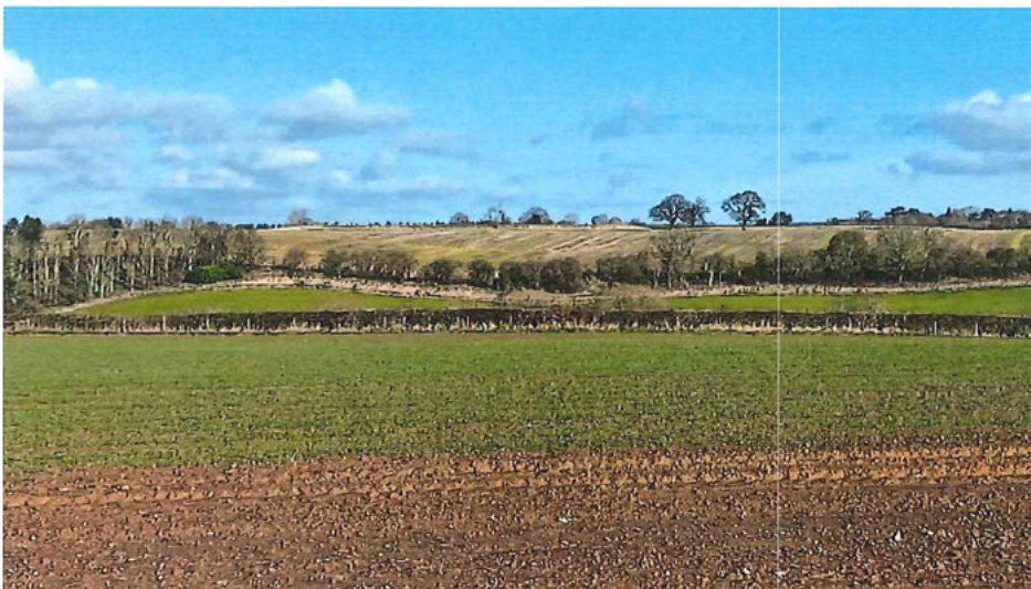
Figure 2 - View North from the PROW at Cantlop towards the road west of Berrington (3/3/2024)