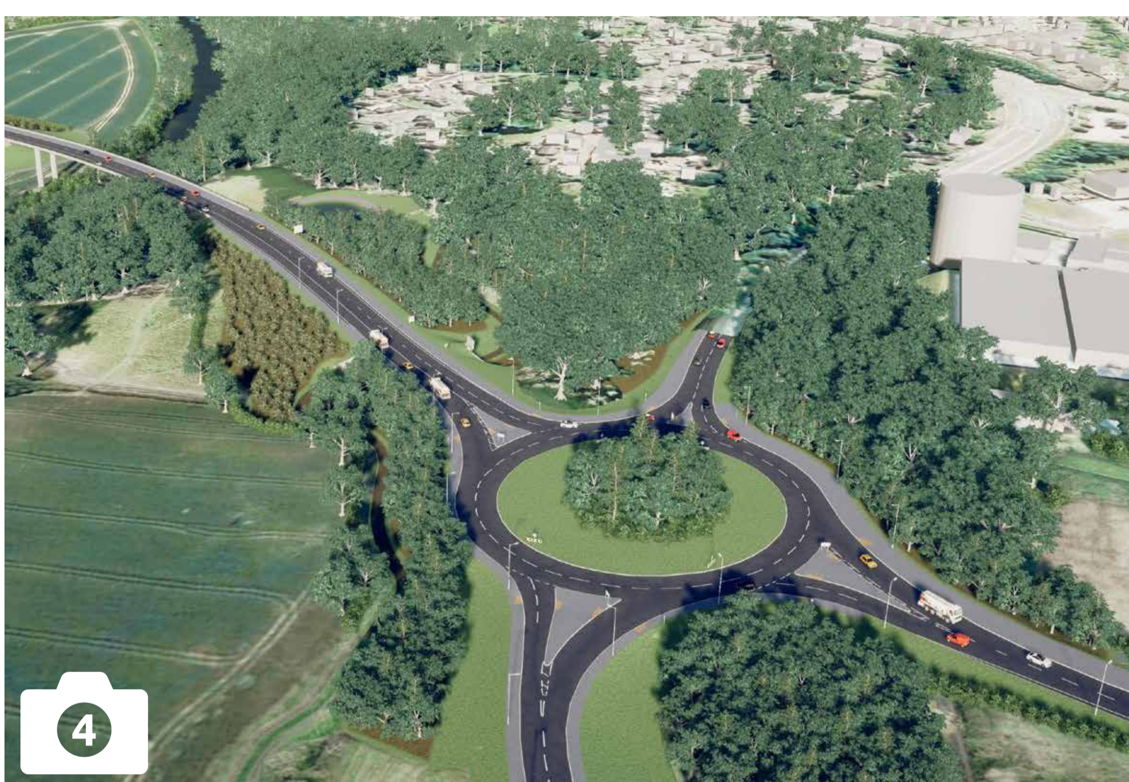
Holyhead Road roundabout (camera facing south east)