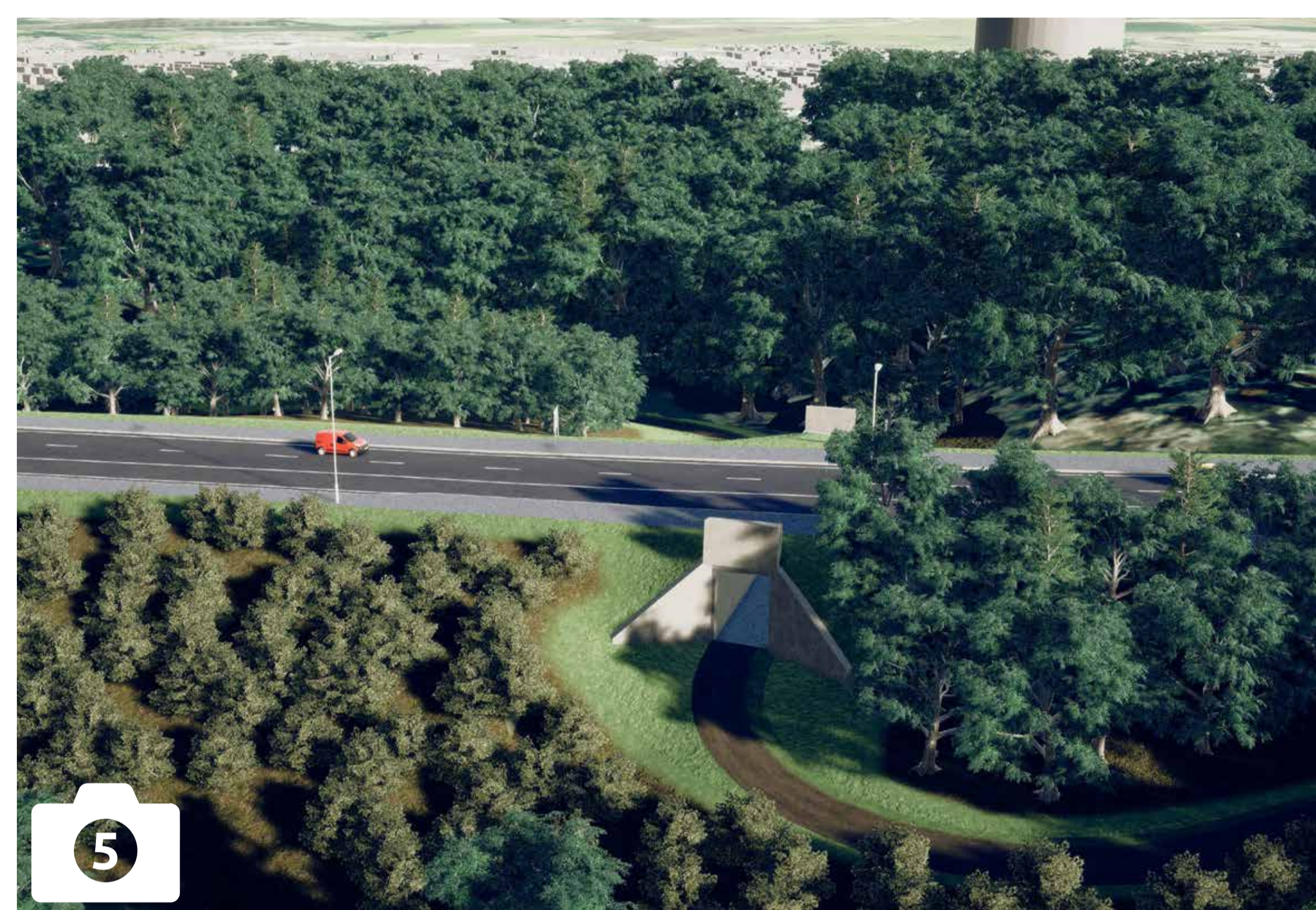
Multi use underpass near Holyhead Road roundabout (camera facing south west)