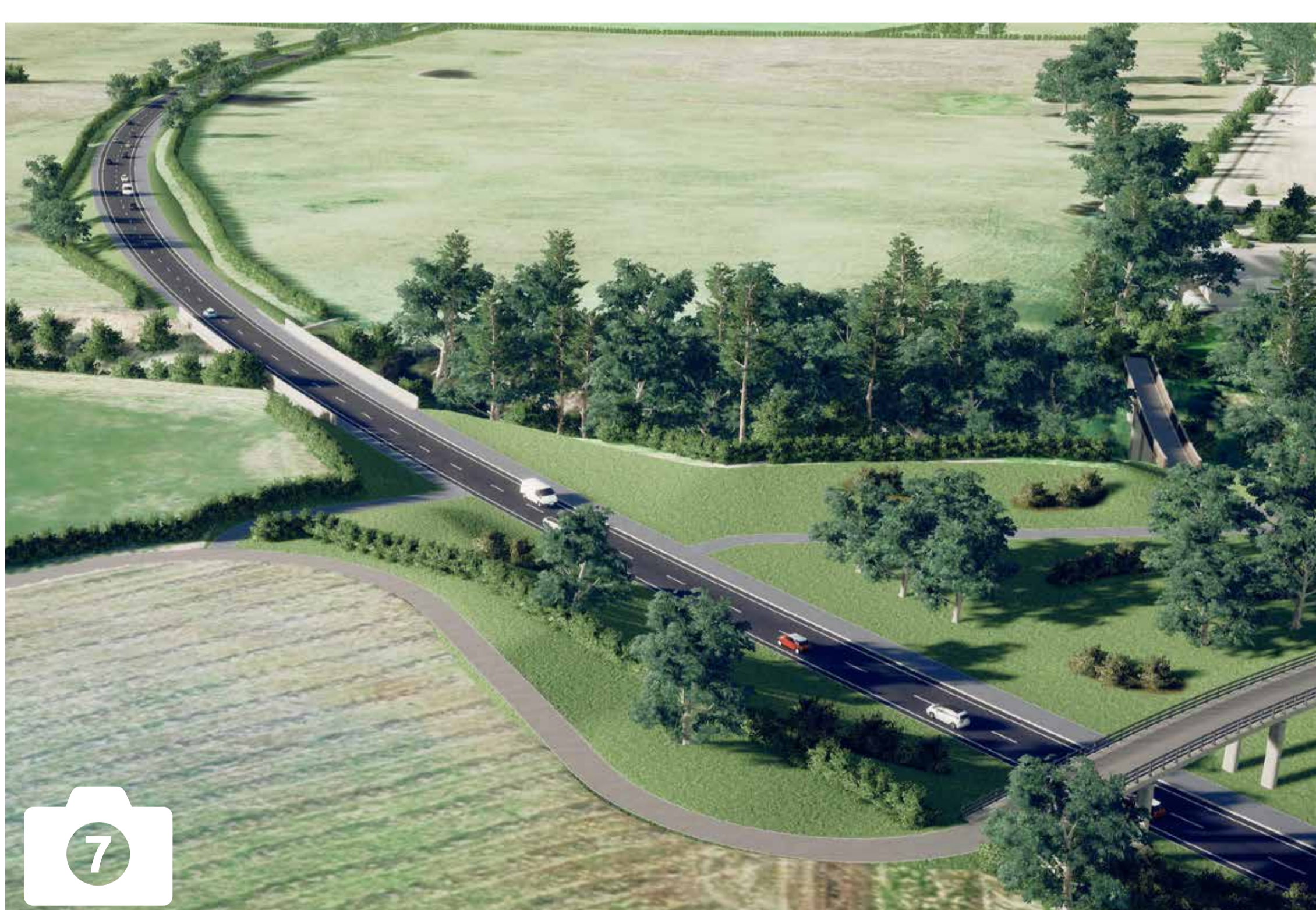
Farm vehicle and Public Right of Way overbridge and separate Railway bridge (camera facing north east)