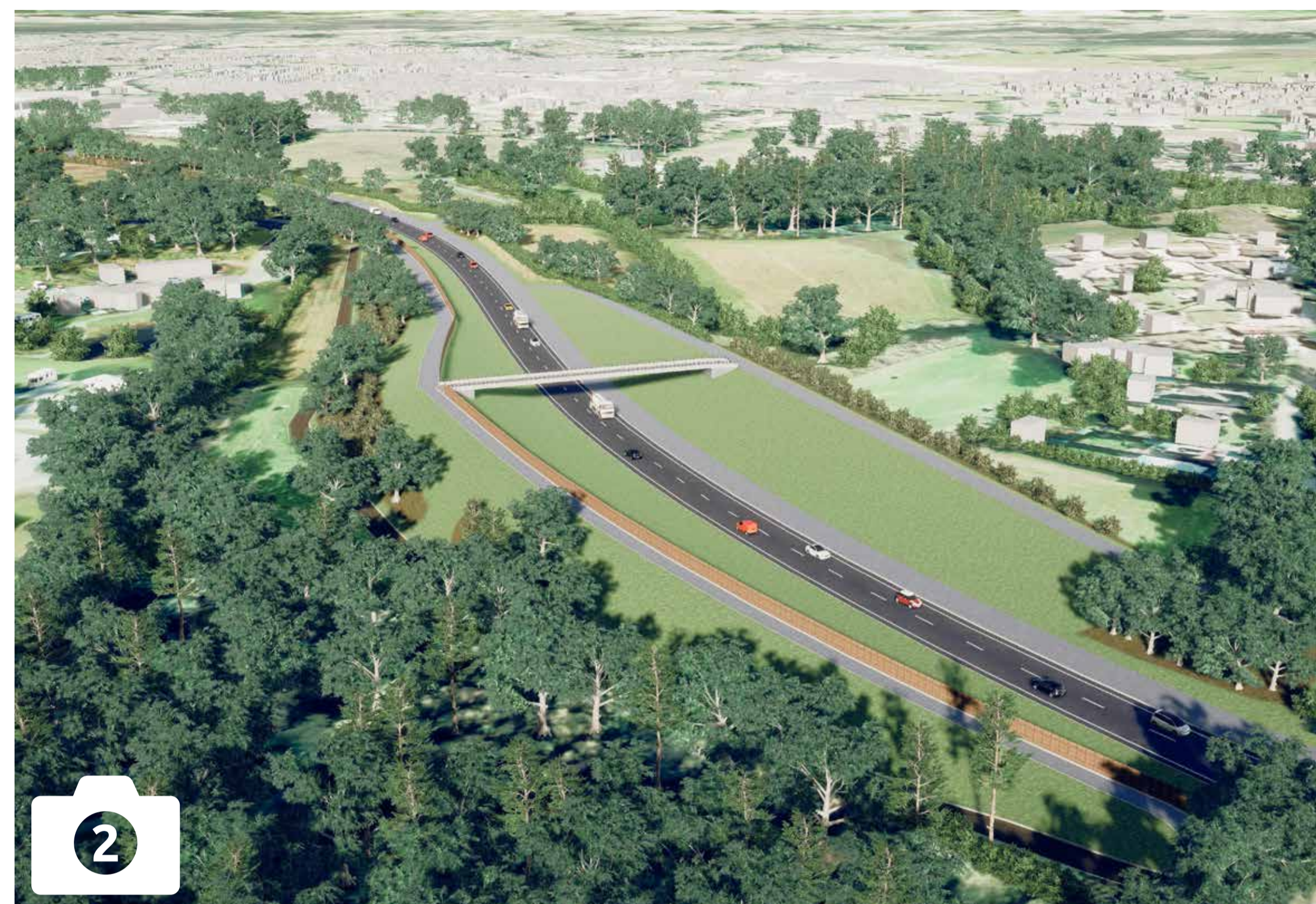
Cycle/footbridge and embankment east of Shepherds Lane (camera facing south east)