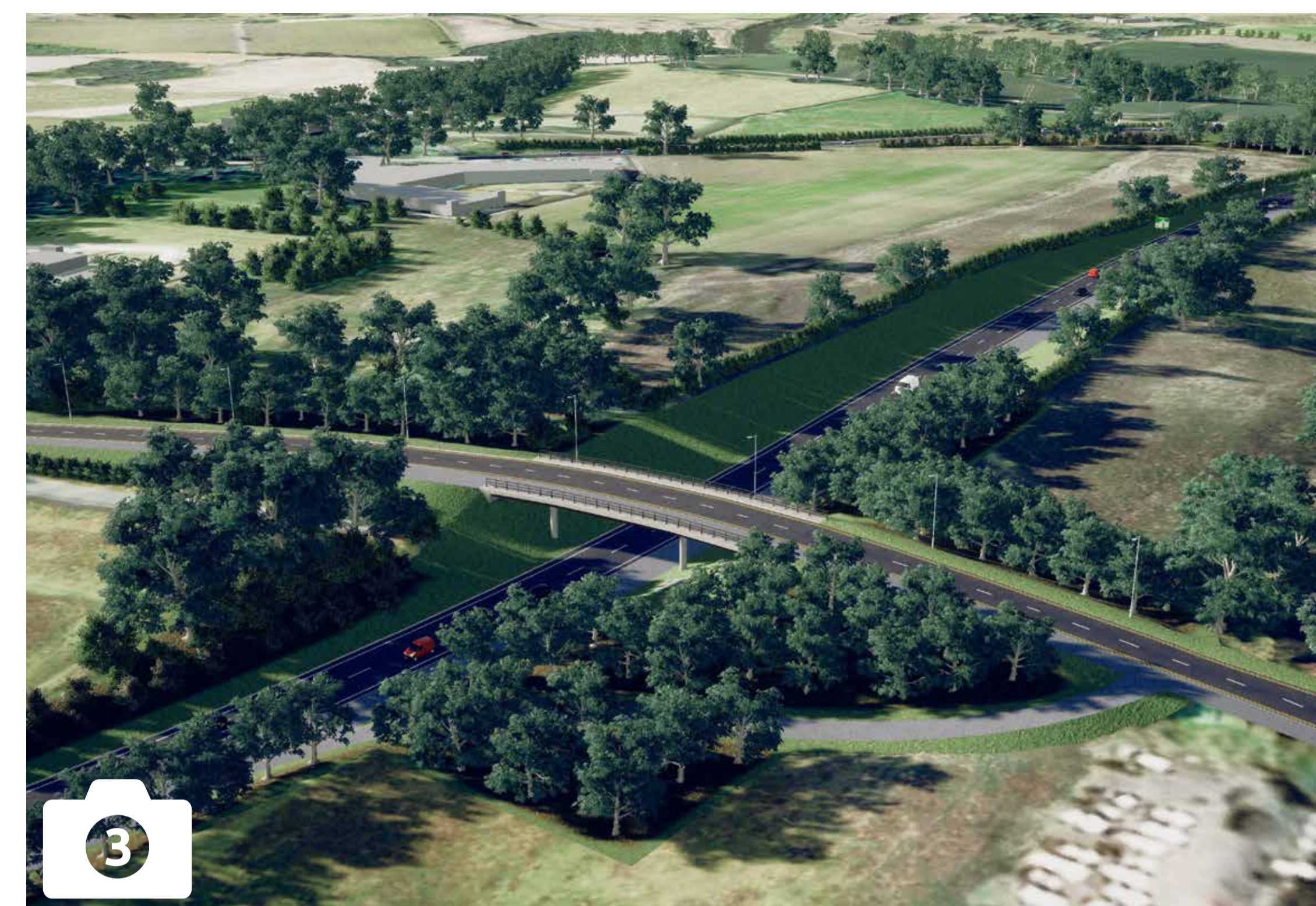
Clayton Way overbridge (camera facing north east)