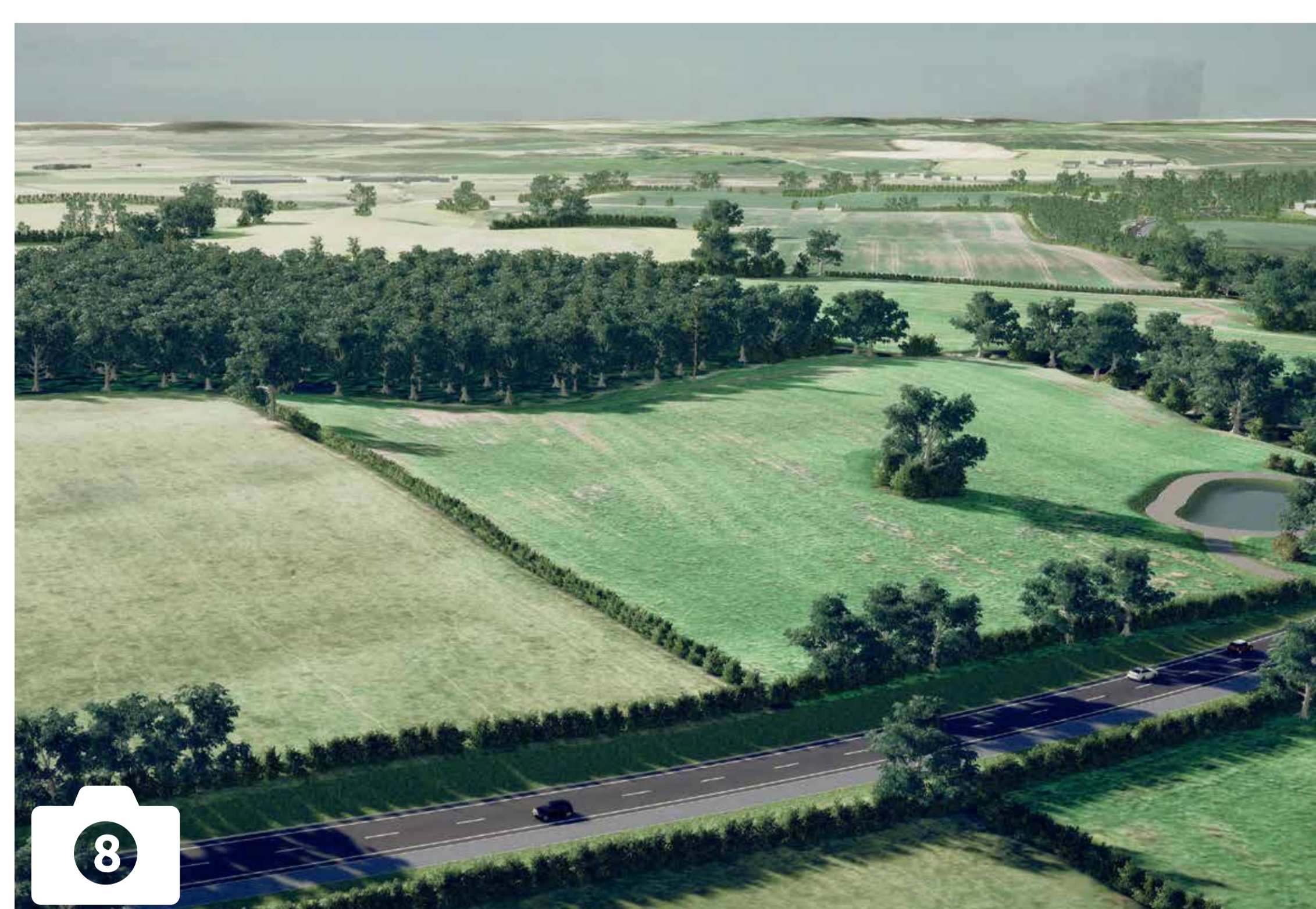
South of Hencott Wood (camera facing north)