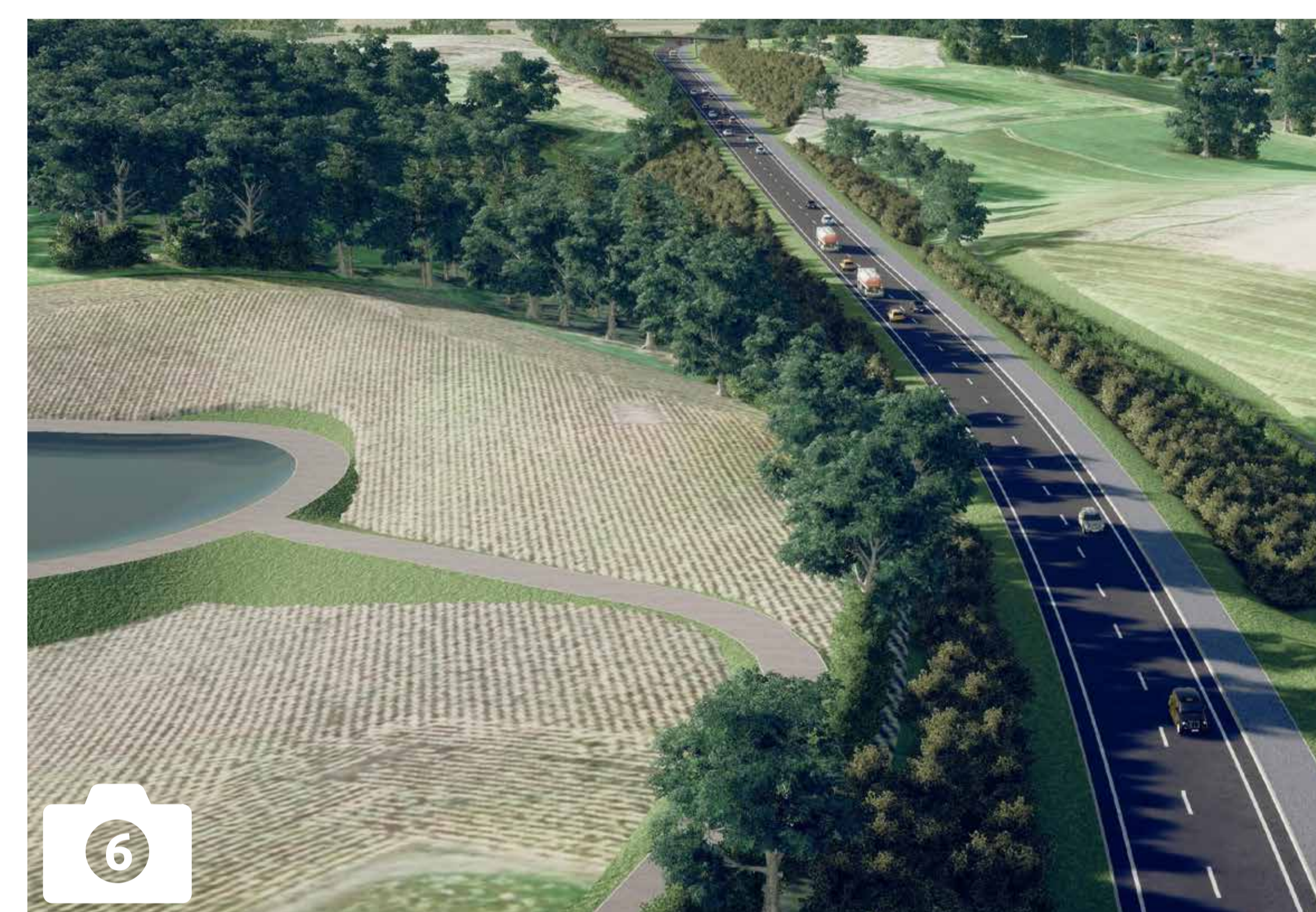
Berwick Road drainage pond (camera facing north east)