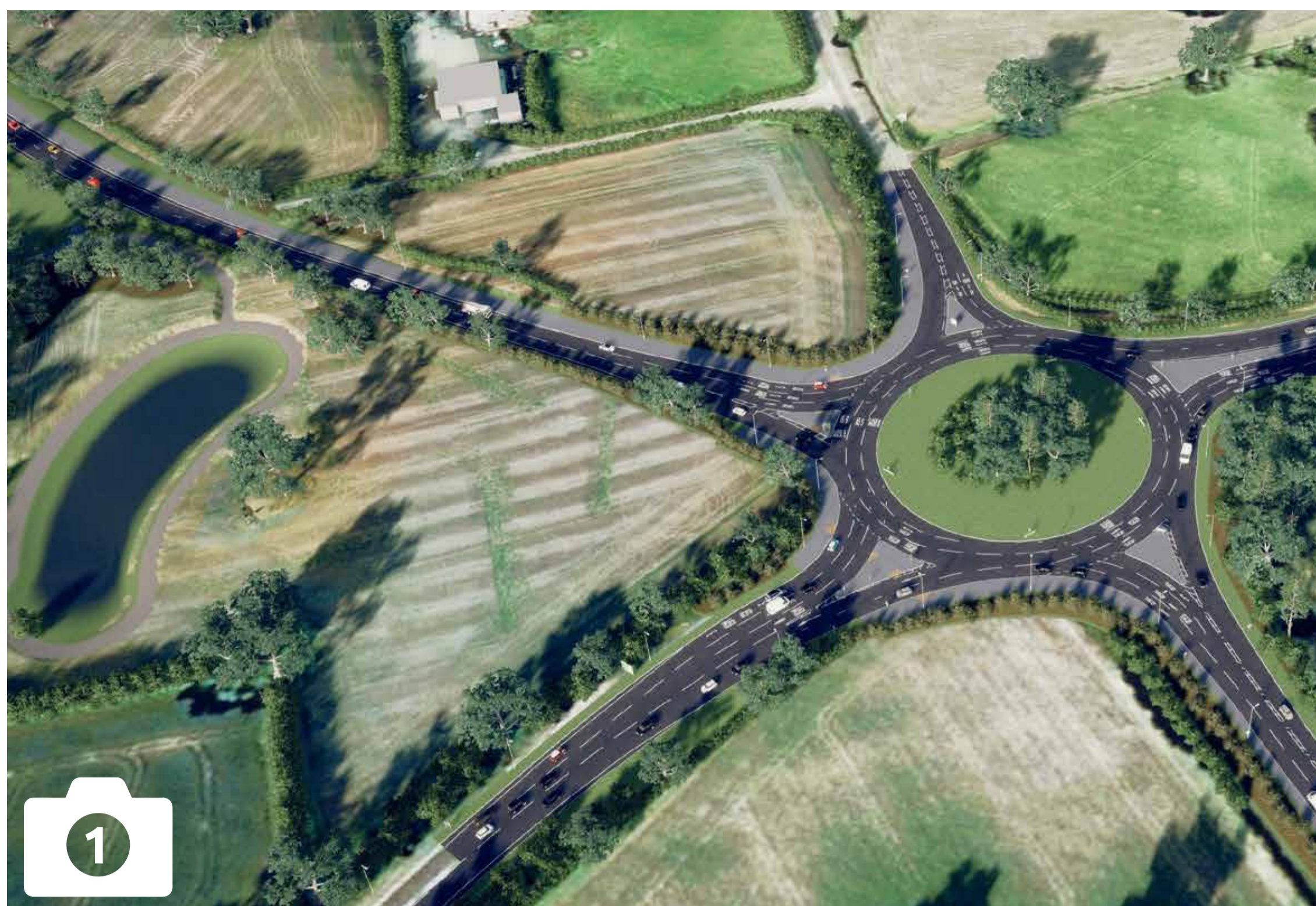
Drainage pond at Churncote roundabout (Camera facing east)

Please view the NWRR Route Map banner for camera positions.