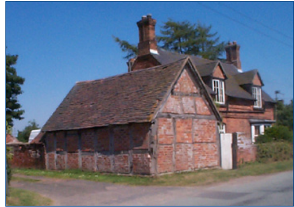
Small-scale farmsteads are a characteristic feature of the uplands but are also a feature of the lowlands of the county, especially on the edges of former and surviving common land (moss, marsh and heath) where small-scale farming remained important into the 19th and 20th centuries. This is a loose courtyard plan with a 17th century working building, probably built as a combined barn and cowhouse, to one side of the yard.

The plan overleaf shows the broad categories of farmstead types that have been mapped across the county and the West Midlands. The illustrated Farmstead Character Statements for the region and the 26 National Character Areas within and adjoining it provide fuller guidance on their landscape and settlement context, and the range of farmstead and building types that are likely to be encountered.