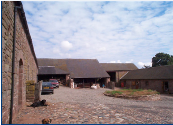
Large-scale courtyard farmsteads developed in the dales of the Shropshire Hills and particularly in the centre and east of the county where larger-scale farms had developed from the 15th century. This was a process that went hand-in-hand with the reorganisation and enclosure of the farmed landscape.