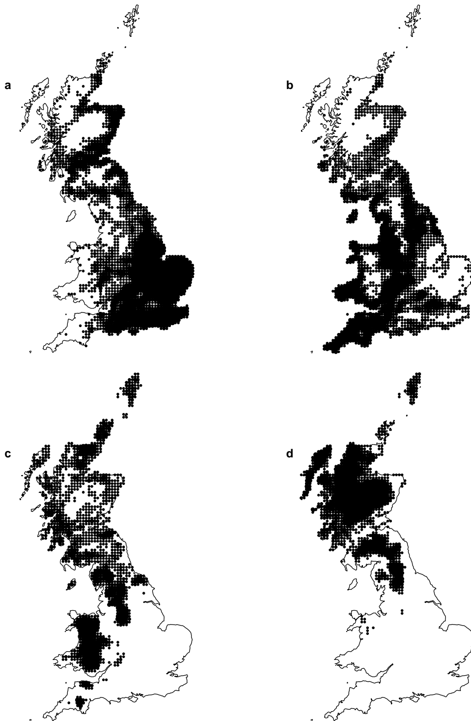
Figure 1. The broad distribution of (a) arable, (b) pastoral, (c) marginal upland and (d) upland ITE Landscape Types in Britain from Barr et al. 18