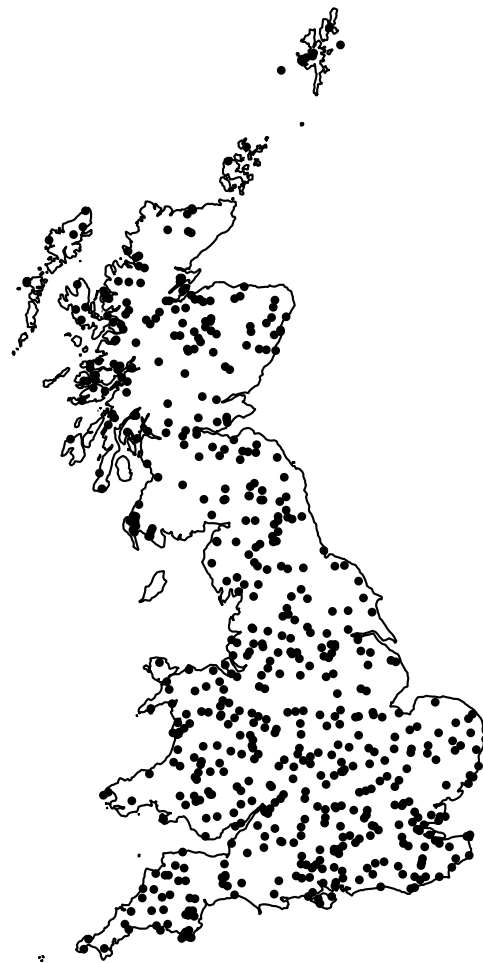
Figure 2. Distribution of 1-km squares that were covered as part of the 1997 national Skylark survey.

Observers were asked to visit each square four times, with visits evenly spread between mid-April and mid-June. The locations of all singing Skylarks were mapped onto the recording form. Observers were not required to walk across areas of suitable habitat in order to 'flush' birds, but were asked to use access roads and tracks (or tractor tramlines if no access routes were available) to ensure that the entire square was surveyed for singing birds only. Volunteers were requested to carry out the surveys early in the morning, where possible within two hours after sunrise, but not before. Volunteers were also advised to take approximately two hours to survey a square and to vary the starting point of the route between visits to avoid bias due to time of day and to avoid surveying in poor weather (wet or windy days)