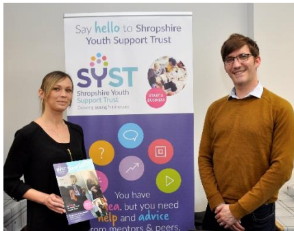
SYST – Shropshire Youth Support Trust