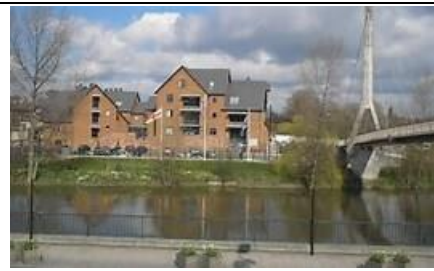
University Centre of Shrewsbury