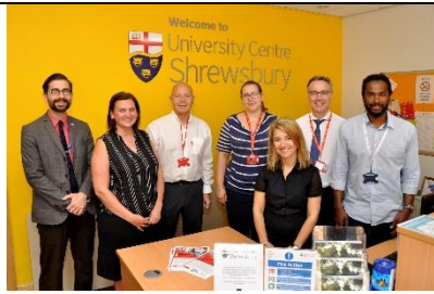
LEAF partners, Shrewsbury