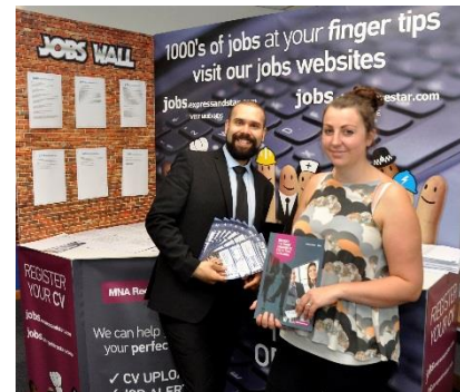
Shropshire Star JOBS WALL