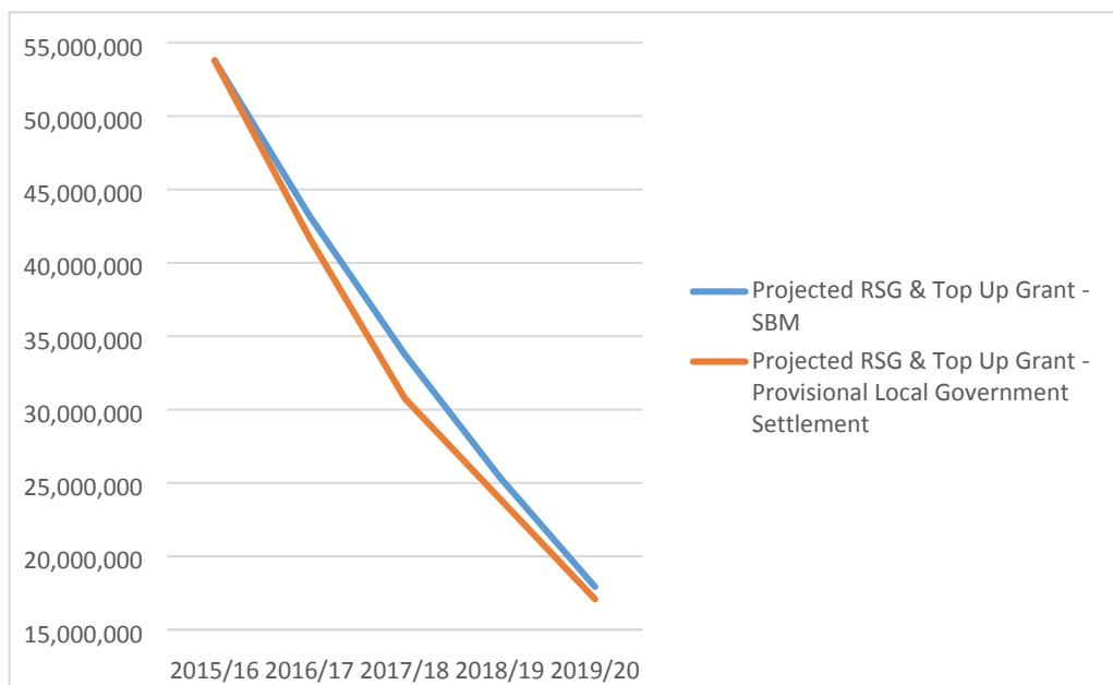
Chart 1: Variation between projected RSG and Top Up Grant (SBM v Provisional Settlement)