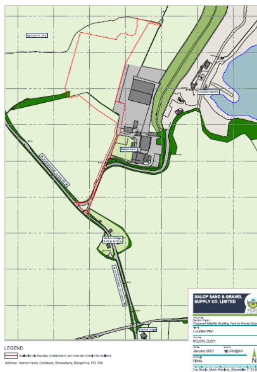
Plan 1 - Location

Recommendation:- Grant Permission subject to the conditions set out in Appendix 1.