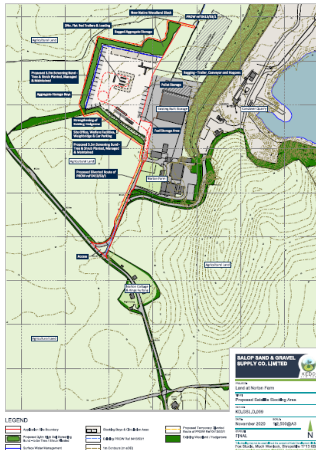
Plan 2 – Layout Plan

1.4 A transport assessment submitted for the Gonsal quarry extension concludes that the permission should not be refused on highway capacity grounds. This conclusion is supported by the Highway Authority. However, Condover Parish Council and some local residents have objected to the proposal given concerns about continued routing of quarry vehicles through Condover. The applicant has put forward the current proposals as a way of addressing these local concerns.