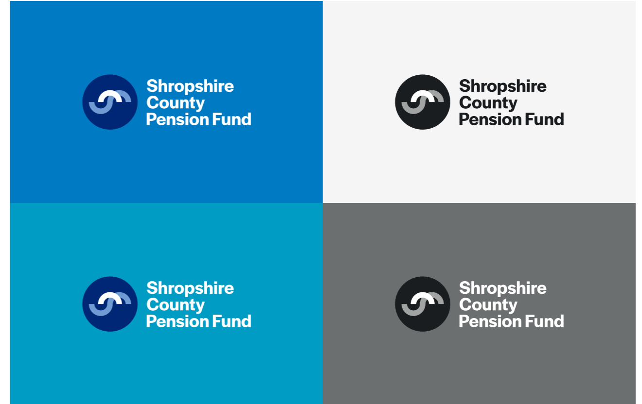
Fig 02: Full logo - inverted on additional core colours