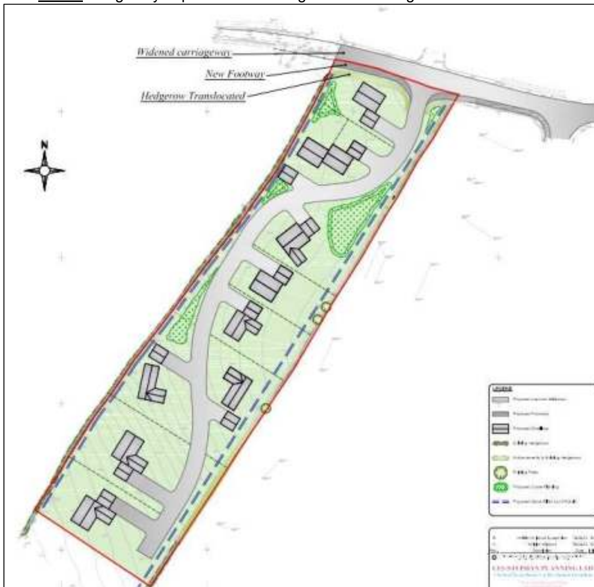
Plan 2 – Highway improvements along the site frontage