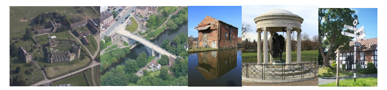
From I-r: The standing remains of Stokesay Castle; The Iron Bridge; Canal Warehouse, Ellesmere ; Shropshire War memorial, The Quarry, Shrewsbury; Upton Magna

We maintain full records on desk-based and field-based investigation in the county and are the repository for archaeological fieldwork and historic building investigation and recording carried out in the county. This is often as a result of development projects, and includes a wide range of material related to the intervention history of heritage assets across the county.