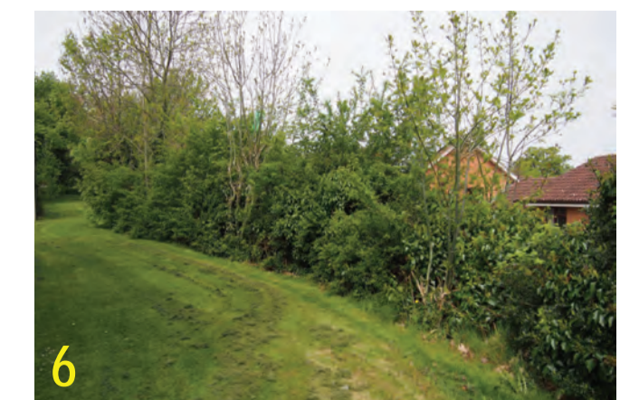
6 View west along the northern boundary to High Ridge Way