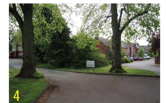
4 View west to Council and south to College Gardens