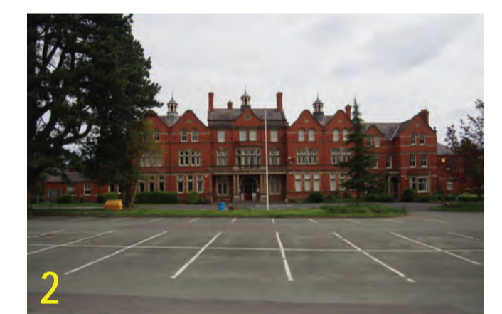
2 Existing late Victorian college building to be retained for conversion into apartments