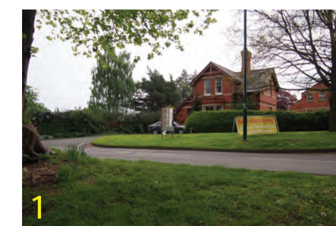
1 Gatehouse building and entrance on Radbrook Road which will be retained