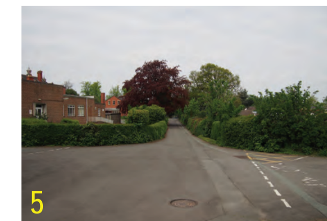
5 View north west down the existing access which may be closed and rerouted