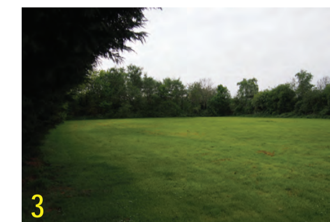
3 View south to the Gransden Drive boundary trees from the disused sports pitch