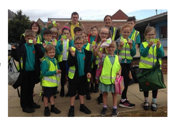
St Laurence CE Primary Walking Bus

Contacts were made with the Police and Crime Commissioners' Office and the West Mercia Road Safer Roads Partnership. This has included; assistance with promotion of 'mini officer' signs outside schools to promote slow speeds and no parking on school keep clear markings, attendance at a series of Road Focus events and issue of hi vis giveaways for young cyclists and children on walking buses.