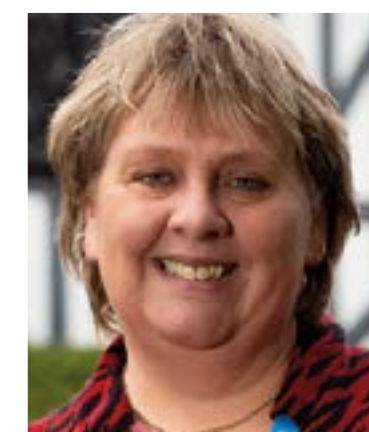
Lezley Picton Leader of the Council

Our Shropshire Plan sets the direction for the next three years up to 2025 within the framework that our longer-term plans and strategies, like our Local Plan and our Cultural Strategy, underpinned by our health and wellbeing plans, set out for the next 10 to 20 years. The challenges and experiences we have shared over recent years puts us in a strong position to step up and move forwards together, and adapt our plans to meet the changing situations we face.