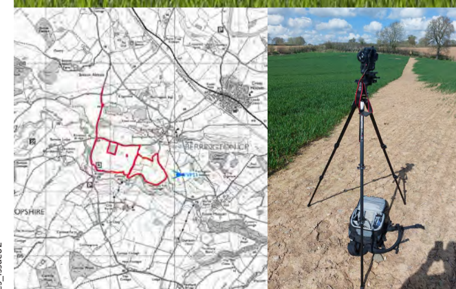
Viewpoint 11: PRoW 0407/16/1, looking west towards the site