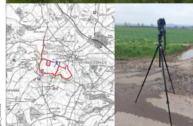
Viewpoint 1: Cliff Hollow, looking south towards the site