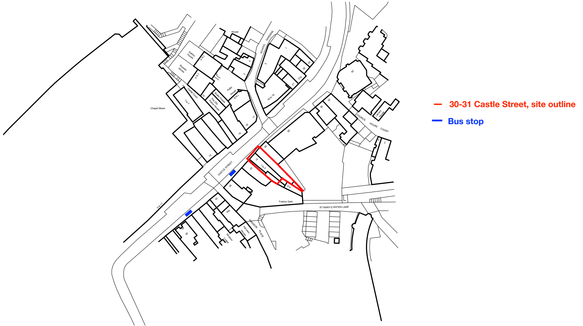
Figure 1, Site Outline