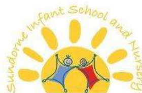
Sundorne Infant School and Nursery