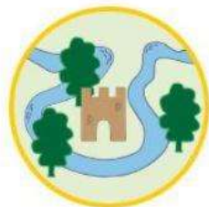
Mount Pleasant Primary School