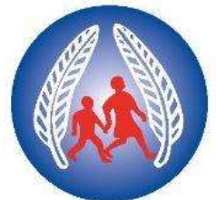
Harlescott Junior School