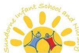
Sundorne Infant School and Nursery