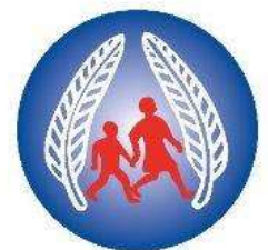
Harlescott Junior School