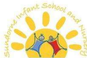
Sundorne Infant School and Nursery