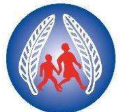
Harlescott Junior School