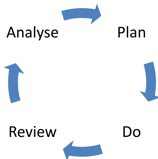
Fig. 3 – The Commissioning Cycle

Commissioning is a cyclical process. It is often represented pictorially as a circle or wheel of activities: